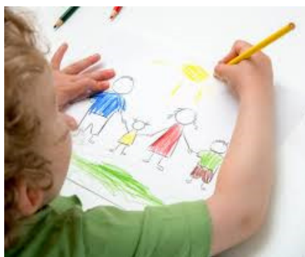
Drawing or colouring